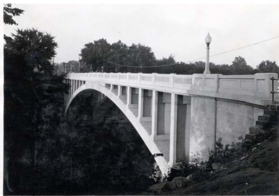
Figure 2.3.1-1 Original Concrete Arch Bridge