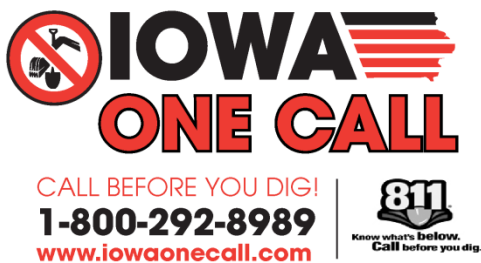
Figure 3: Iowa One Call.

Provide the Iowa One Call number on the Title Sheet.