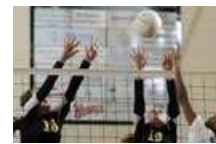
Catholic High vs Tallahassee Godby in varsity volleyball