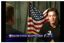
Former Navy Seal speaks on special training