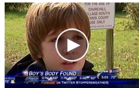
School Reactions To Missing Boy's Body Found