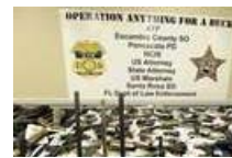
Brownsville Sting Operation