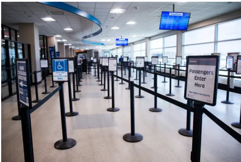
Foot traffic is sparse on April 14, 2020 at the Des Moines International Airport. The airport has closed a terminal, shut down services and delayed projects, including an Allegiant base, to save money during the spread of COVID-19.