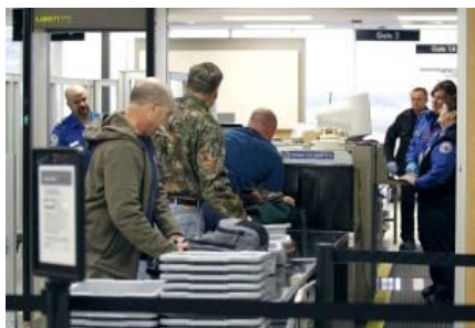
Passengers go through security at Sioux Gateway Airport in September. American Eagle, a regional carrier of American Airlines, will start offering two daily connecting flights between Sioux City and Chicago O'Hare International Airport on April 3.

You recommend EXCLUSIVE: American's Sioux City flights start April 3. Insights Error