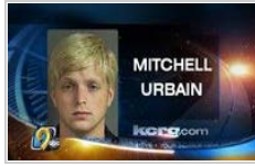
Iowa City Man Seriously Injured Himself While...