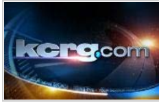
Iowa City Man Wakes To Drunken Man Sleeping on His...