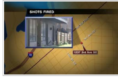
Cedar Rapids Police Investigate Shots Fired