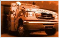
Missing Boy's Body Found in Refrigerator