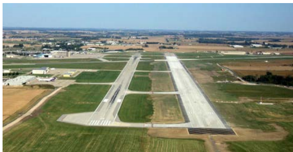
The Eastern Iowa Airport.