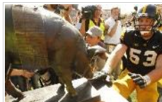
Iowa Wins: Bacon Makes Everything Better