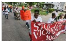
"Stop The Violence" March After Cedar Rapids Woman...