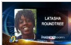
Investigators Return to Scene of Roundtree Shootin...