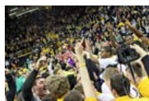
DI Story of the year: Men's Basketball