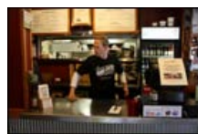
IC restaurant offers internship