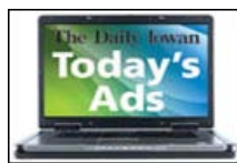
Today's Display Advertising