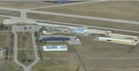
Mason City Airport