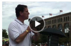
Rick Santorum at The Des Moines Register so... Aug 12, 2011