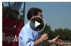
Rick Perry at The Des Moines Register soapbox Aug 15, 2011