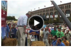
Thaddeus McCotter at The Des Moines Regist...