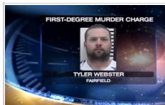
Officials Investigate Shooting Death in Jefferson ...