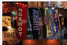
BEST Beer Selection