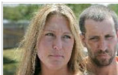
Mother of Missing Girl Hospitalized