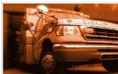
Man Dies from Injuries Received in Motorcycle Cras...