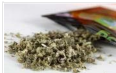
Rescue Crew Called to High School