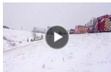
Crews extricate occupants after accident