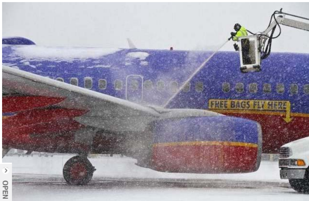
Southwest Airlines plans to fly to Las Vegas from Des Moines.