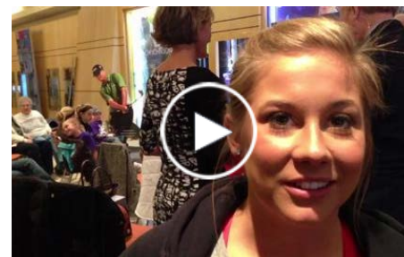
Who left Shawn Johnson 'starstruck'