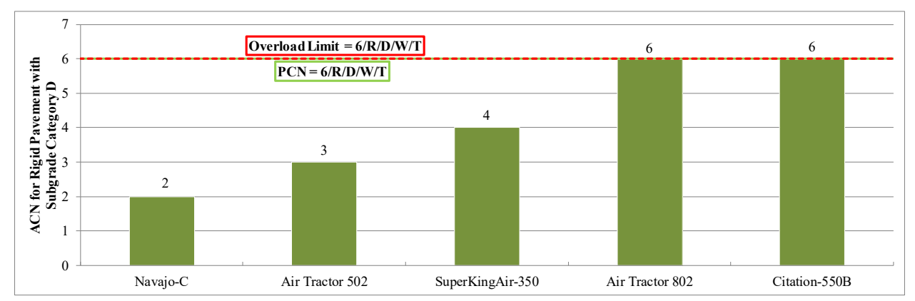
Figure 1. ACN–PCN comparison for Runway 3-21.