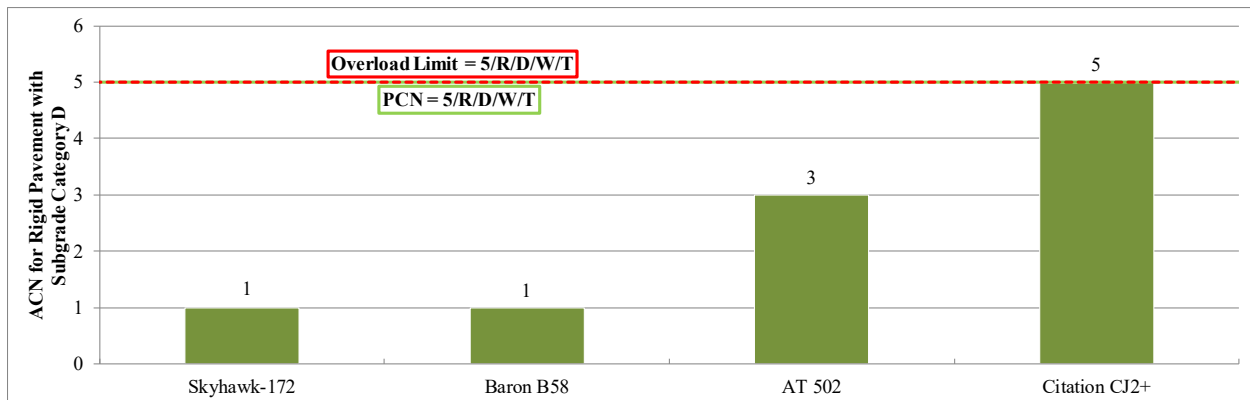
Figure 1. ACN–PCN comparison for Runway 17/35.

The PCN for Runway 10/28 could not be determined using the Technical Evaluation Method. Following the Using Aircraft Method, the PCN for Runway 10/28 is 5/R/D/W/U as shown in Figure 2. While FAA Advisory Circular states a concern regarding the Using Aircraft Method, a PCN of 5/R/D/W/U is determined for this runway based on the ACN of the most demanding aircraft in the traffic mix.