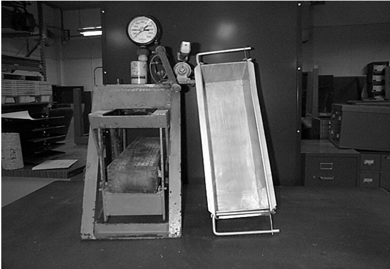
Figure 2. Concrete Specimen in Hydraulic Testing Machine

Always make sure the pointers on the gauge are set at zero before any loading begins.