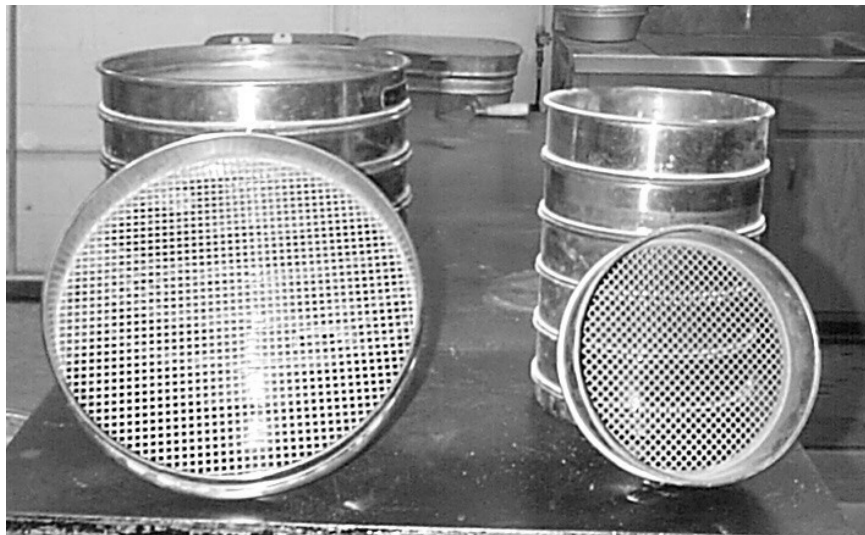
Figure 2. Fine Sieves