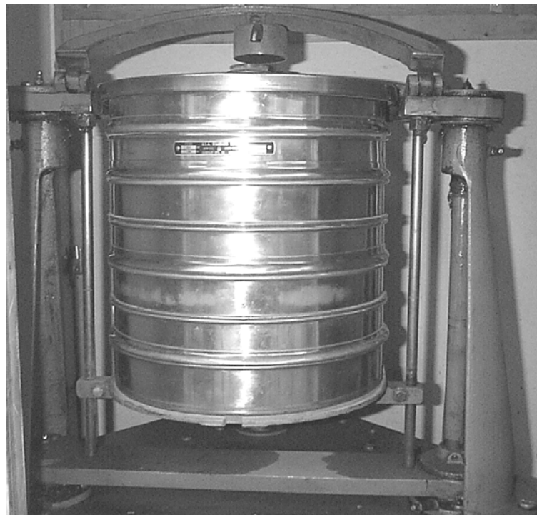
Figure 4. Coarse Sieves Mounted in "Ro-Tap" Shaker