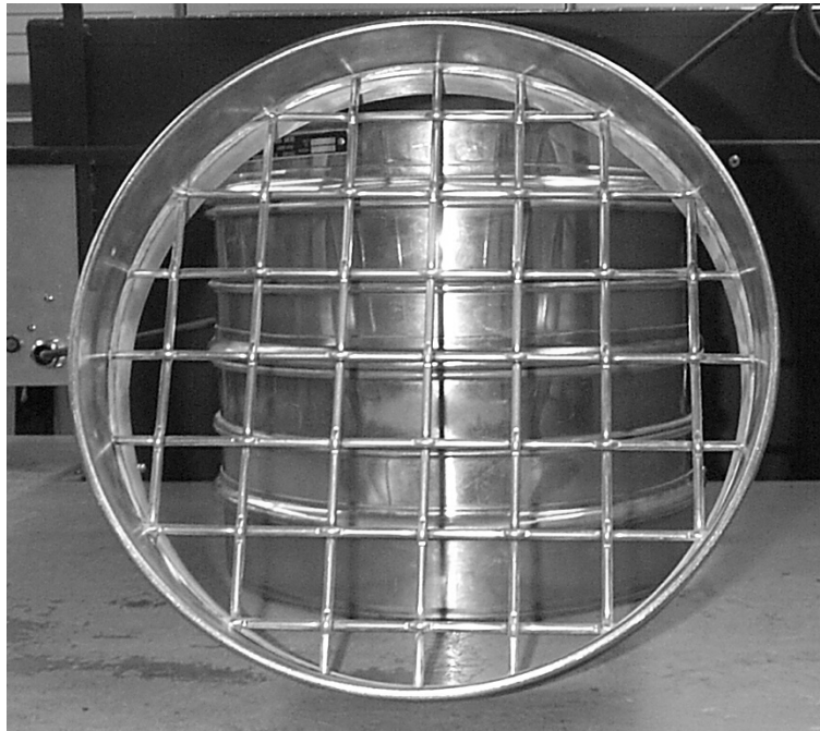
Figure 3. Coarse Sieves