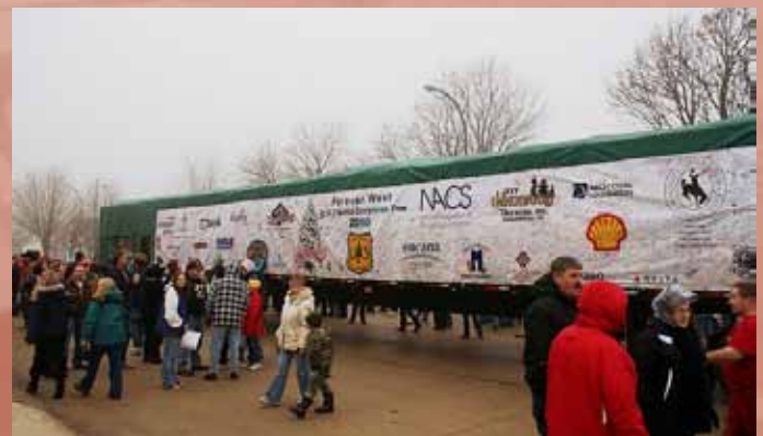
U.S. Capitol Christmas Tree making a stop in Britt.