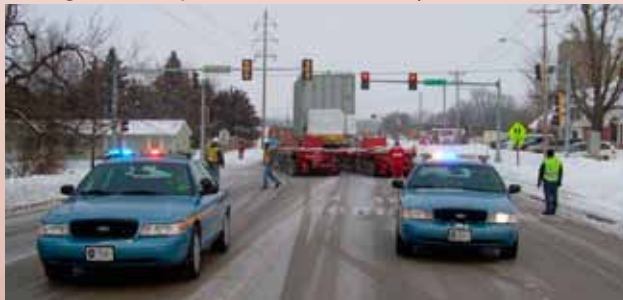
Several agencies worked together to coordinate movement of the largest load ever permitted on an Iowa highway.

Execution of the seven-mile move took approximately six hours. The Iowa DOT began planning for transport of the load last year. The transformer was originally expected to arrive in the fall of 2009. Manufacturing and shipping delays altered the arrival date, but the Iowa DOT was able to work with multiple carriers and equipment configurations throughout the process to successfully move the load.