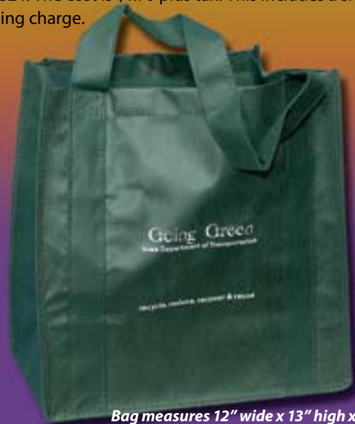
Bag measures 12" wide x 13" high x 8 deep"

For personal use, please call office supplies at 515-239-1324. The cost is $1.70 plus tax. This includes a small shipping charge.