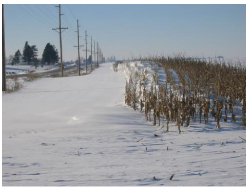
An example of a standing corn fence. Notice the snow trapped between the stalks.

The department will pay the farmer/landowner based on its assumed yield. Price per bushel is determined using the statewide average cash price on August 1<sup>st</sup> each year plus $2.00 per bushel. Agreements only go from fall to spring and can be renewed each year.