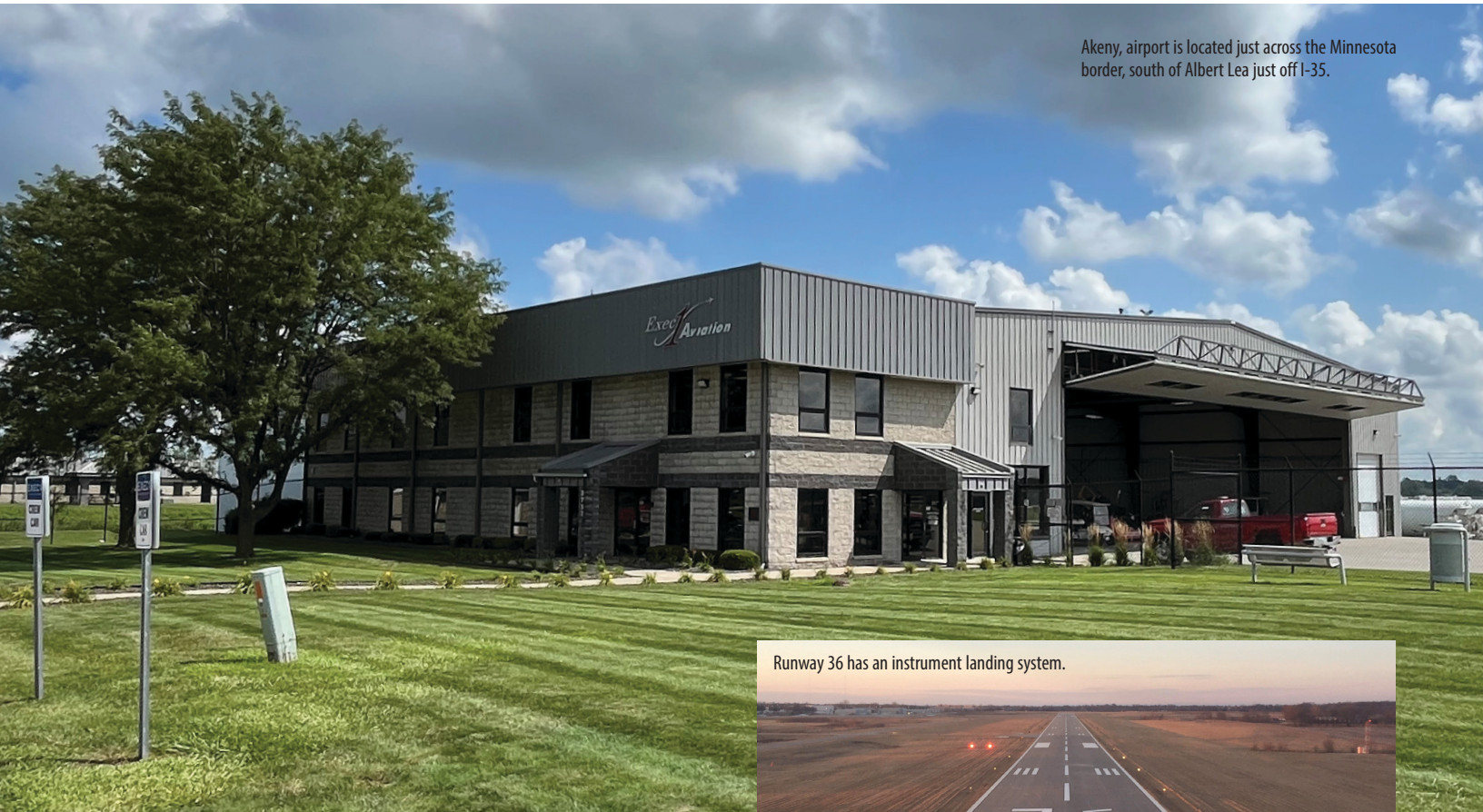
Runway 36 has an instrument landing system.

Ankeny, airport is located just across the Minnesota border, south of Albert Lea just off I-35.