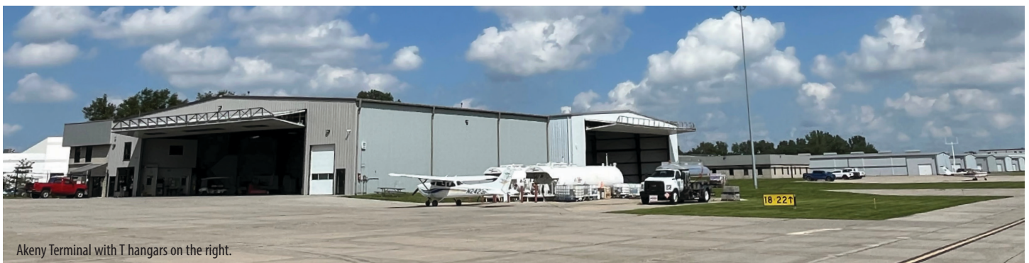
Ankeny Terminal with T hangars on the right.

Ankeny Regional Airport has everything needed by business and private aviation, but pilots should be on their best aeronautical behavior there because it's also the home of the FAA Flight Standards District Office.