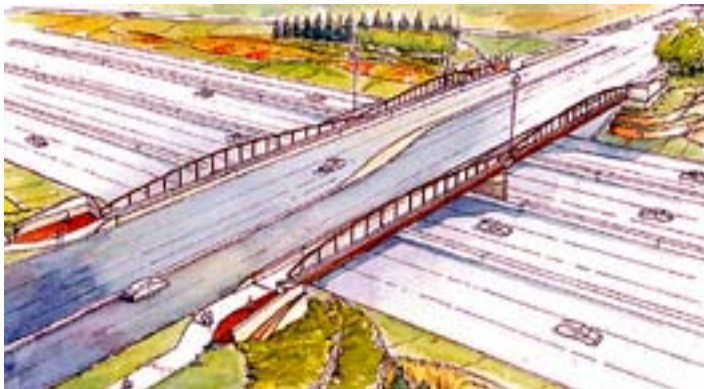
Figure 7 - Rendering of completed 24 th Street project (HDR Inc.)

The new bridge at 24 th Street (Figure 7) is a two-span, 353-foot continuous steel girder bridge with composite precast deck panels (Figure 8). The bridge has an overall width of 105-feet, 8-inches, including sidewalks and a shared use lane. The bridge deck is comprised of 52-foot 4-inches wide by 10-foot long by 8-inches thick precast concrete deck panels joined together with a 1-foot wide cast-in-place longitudinal joint. The deck panels are pretensioned transversely and post-tensioned longitudinally after placement. The deck panels (Figure 9) were compositely bonded to the girders by shear studs and grouted stud pockets.