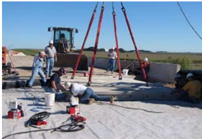
Figure 13 - Precast approach slab being placed at the O’Brien County project site

Based on the precast panel layout and panel dimensions, a transversely pretensioned, longitudinal post-tensioned approach slab was not practical. Instead, two-way post-tensioning was used to tie all of the precast panels together and provide the necessary structural prestressing for the connections.