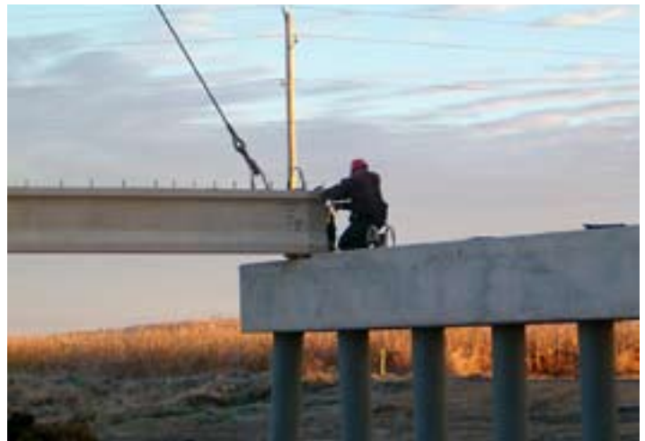
Figure 2 - Precast bridge elements mean easier and faster installation in the field, eliminating the need for prolonged closures and time spent in construction areas for workers

Safety, convenience and time savings are major benefits of ABC. Accomplishing demolition while construction is being done off-site saves time—then quickly installing the new bridge elements after the site has been prepared increases safety (Figure 2). By fabricating bridge elements