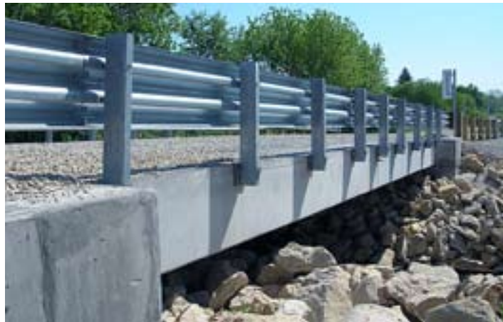
Figure 10 - Completed Madison County bridge

The replacement precast structure (Figure 10) is a longitudinally pretensioned, two-lane, single-span, box-girder bridge that spans 46-feet 8-inches center-to-center of supports and has an out-to-out deck width of 24-feet 1-inch.