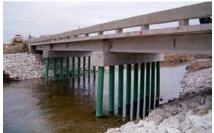
Figure 4 - Completed Boone PPC beam bridge

At the Boone County project site, the existing Marsh Rainbow Arch Bridge (the Mackey Bridge) over Squaw Creek was replaced by a pretensioned, prestressed concrete (PPC) beam bridge (Figure 4). The replacement structure is a continuous, 151- by 33-foot, three-span bridge with a four-girder cross section. The prestressed concrete girders support a full-depth, precast concrete deck.