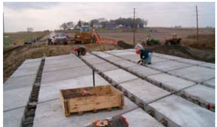
Figure 5 - PPC deck panels at the Boone County project site

At the Boone County project site, the existing Marsh Rainbow Arch Bridge (the Mackey Bridge) over Squaw Creek was replaced by a pretensioned, prestressed concrete (PPC) beam bridge (Figure 4). The replacement structure is a continuous, 151- by 33-foot, three-span bridge with a four-girder cross section. The prestressed concrete girders support a full-depth, precast concrete deck.