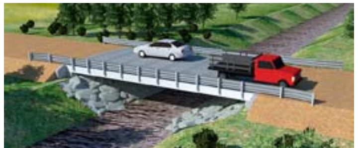
Figure 16 - Rendering of the upcoming Buena Vista bridge project (Stuart Nielsen, Iowa DOT)

Iowa DOT has future projects in sight and is currently working with the Buena Vista County engineer in planning construction of a single-span, 50- by 28-foot precast, pretensioned concrete box-girder bridge on a local road. This bridge will incorporate prefabricated components for both the substructure (precast abutment footings), and superstructure (precast box girders), and is currently under design (Figure 16). The goal is to build this county bridge using precast components during the summer of 2009 in two weeks or less.