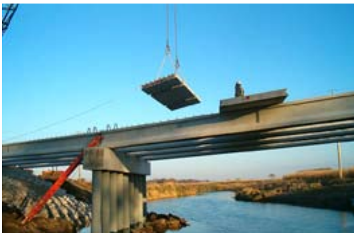
Figure 1 - Placing full-depth, precast deck panels at the Boone County project site

According to Vasant Mistry, bridge and tunnel team leader in the FHWA's Office of Bridge Technology, the need to move quickly and efficiently for renovation or replacement of bridges, while keeping costs as low as possible, is paramount for the future of our nation's infrastructure. "ABC can help keep costs low, and reduce traffic and environmental impacts while bridges are being replaced or repaired," Mistry said. "The way we replace bridges is becoming more