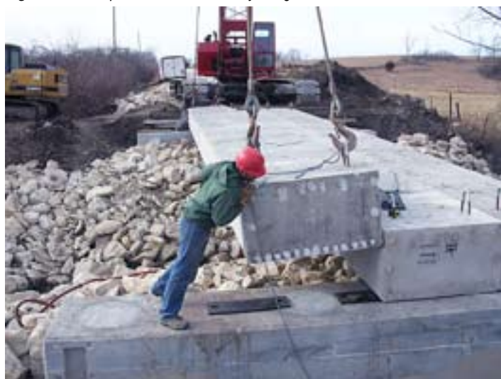
Figure 11 - Placement of box girders at the Madison County site

The bridge consists of six 2- by 4-foot box girders placed side by side (Figure 11) with a hand-tightened transverse tie located at the midspan. The supporting substructure consists of five HP10x42 piles at each abutment and a precast abutment footing. The precast abutment footing is 27-feet 4-inches long, 3-feet wide and varies in depth from 3-feet 6-inches at the ends to 3-feet 9-inches in the middle. The precast abutment footings have five corrugated metal pipe blockouts placed vertically at the pile locations for connection to the piles.