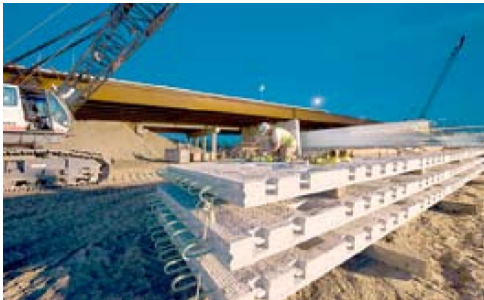
Figure 8 - Preparation of precast deck panels for placement on the 24 th Street bridge