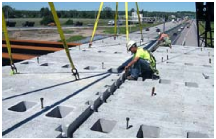
Figure 9 - Deck panel placement at 24 th Street project site

The project was let using A+B bidding, a method of rewarding a contractor for completing a project as quickly as possible. By providing a cost for each working day, the contract combines the cost to perform the work ("A" component) with the cost of the impact to the public ("B" component) to provide the lowest cost to the public. The winning bid on the project bid was 175 calendar days, 35 days less than the maximum allowable bid of 210 calendar days. Intelligent transportation systems were used to manage traffic delays during construction and ease post-construction congestion. Using ABC techniques allowed this bridge to be constructed in a single construction season (typically a two season project) while staging minimized traffic disruptions.