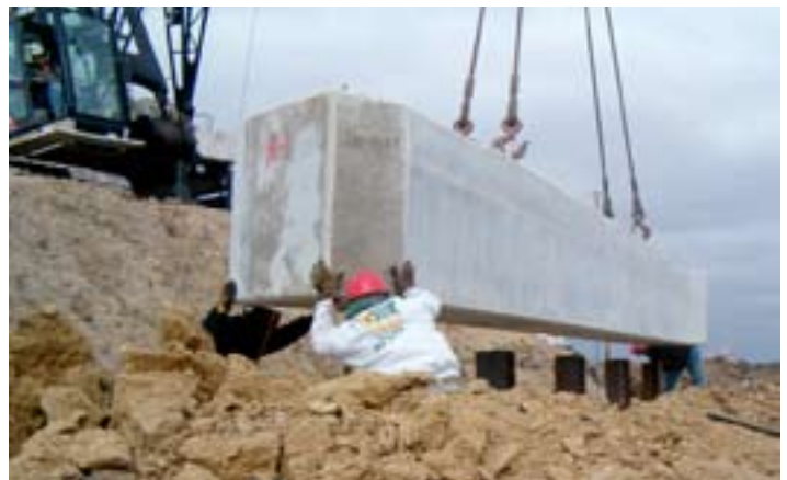
Figure 6 - Placement of precast abutment footing was accomplished in less than 15 minutes at the Boone County site.

The Boone County bridge is an IBRC program project and incorporates precast abutments, pier caps, beams, and full-depth deck panels. This is the first time the Iowa DOT has used the precast abutment and pier cap. It is the second time this type of deck panel has been used in the United States. Iowa DOT officials used this replacement bridge to determine the feasibility of using precast concrete bridge components to accelerate construction for future projects in the state.