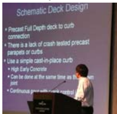
Figure 3 - Michael Culmo, CME Associates, presents a workshop session at the ABC conference held in August 2008

Another workshop session focused on examining standard ABC details currently used in Iowa and identified potential improvements (Figure 3). The topic of connection details for prefabricated pieces was of special interest. "Connectivity is key to the success of ABC," said Michael Culmo, an engineer with CME Associates from East