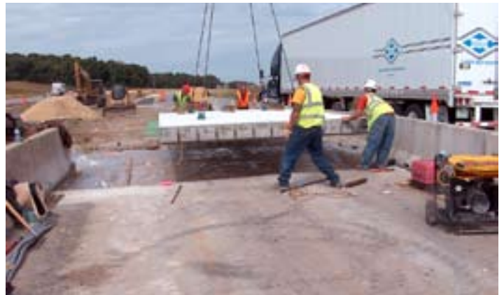
Figure 15 - Bridge approach replacement operations under restricted traffic at the Bremer County bridge site

On the Bremer County project, the contractor was required to complete each stage (one traffic lane and adjacent shoulder) during a 12-hour lane closure period. The contractor had ample time to remove the existing approach pavement, place special base material and the panels (Figures 15).