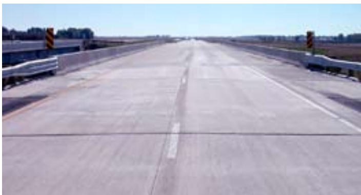
Figure 12 - Iowa 60 award-winning precast, post-tensioned approach slab in O’Brien County

A new integral abutment bridge on Iowa 60 in O’Brien County near Sheldon was chosen as a test bridge for the installation of precast, post-tensioned concrete approaches—the first known application in the United States. The structure is a three-span, continuous prestressed, concrete-girder bridge, 303- by 40-feet, with a right-ahead, 30° skew angle (Figure 12).