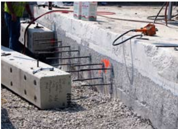
Figure 14 - Precast paving notch system during placement at Marion County bridge site

The precast paving notch system was intended for use in either new construction or as rapid replacement for installation in single-lane widths to allow for staged construction under traffic with a single overnight bridge closure. The system consists of a rectangular block, 16- by 16-inches precast, prestressed concrete element that is connected to the back face of the abutment using high-strength, threaded stainless steel rods and an epoxy adhesive similar to that used in segmental bridge construction (Figure 14).