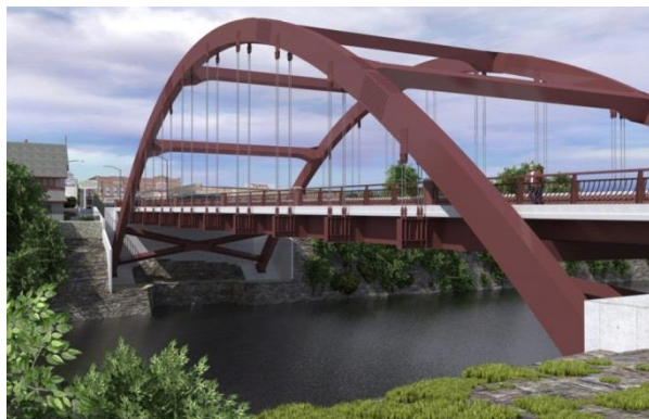
Figure 2.3.2-2 Replacement Steel Arch Bridge