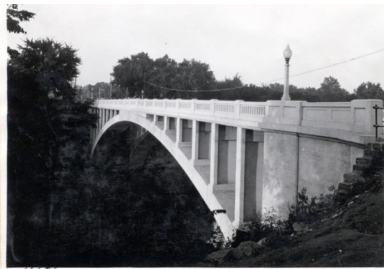
Figure 2.3.2-1 Original Concrete Arch Bridge

The Iowa DOT sought input from the community during the planning stages of project development. The result was a local preference for the concrete arch bridge to be replaced with another arch structure, thus keeping the river free of supporting piers and maintaining the aesthetic appeal of the arch bridge theme prevalent at the two other nearby river crossings in town. An above-deck, steel through-arch bridge type was chosen as the final concept. The new bridge will feature a 42-foot roadway, a sidewalk and a bicycle trail.