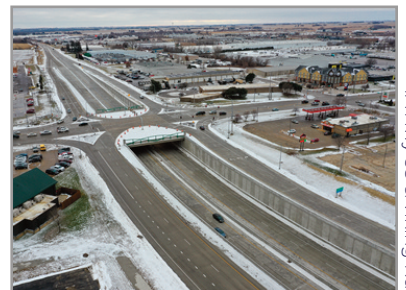
IA Hwy 58 & Viking Rd.