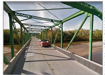
7th Street Bridge - Janesville