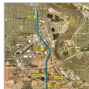
La Porte Rd/Hess Rd