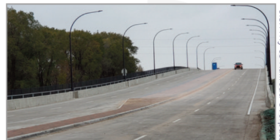
U.S. Hwy 63 Railroad Overpass