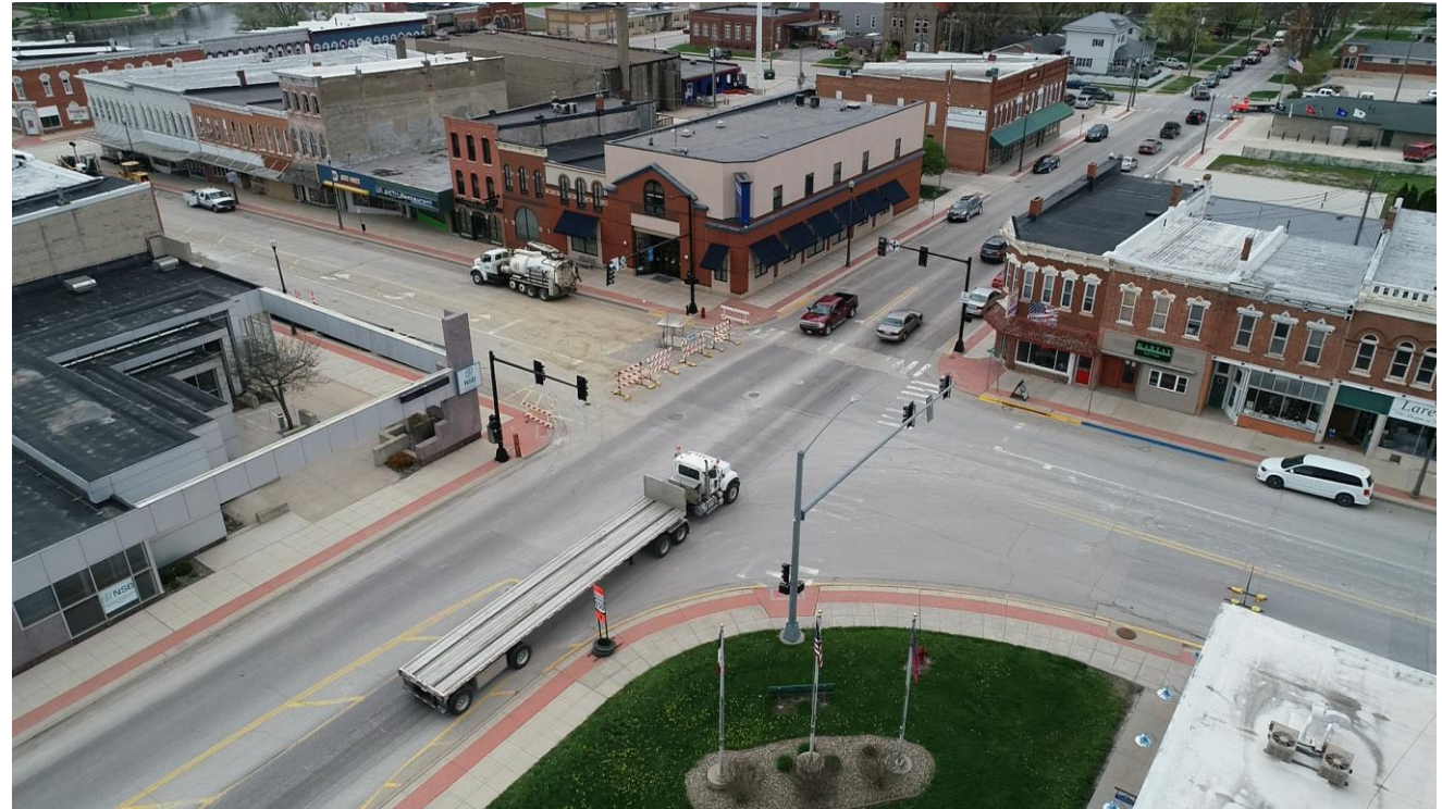
Independence downtown along Highway 150