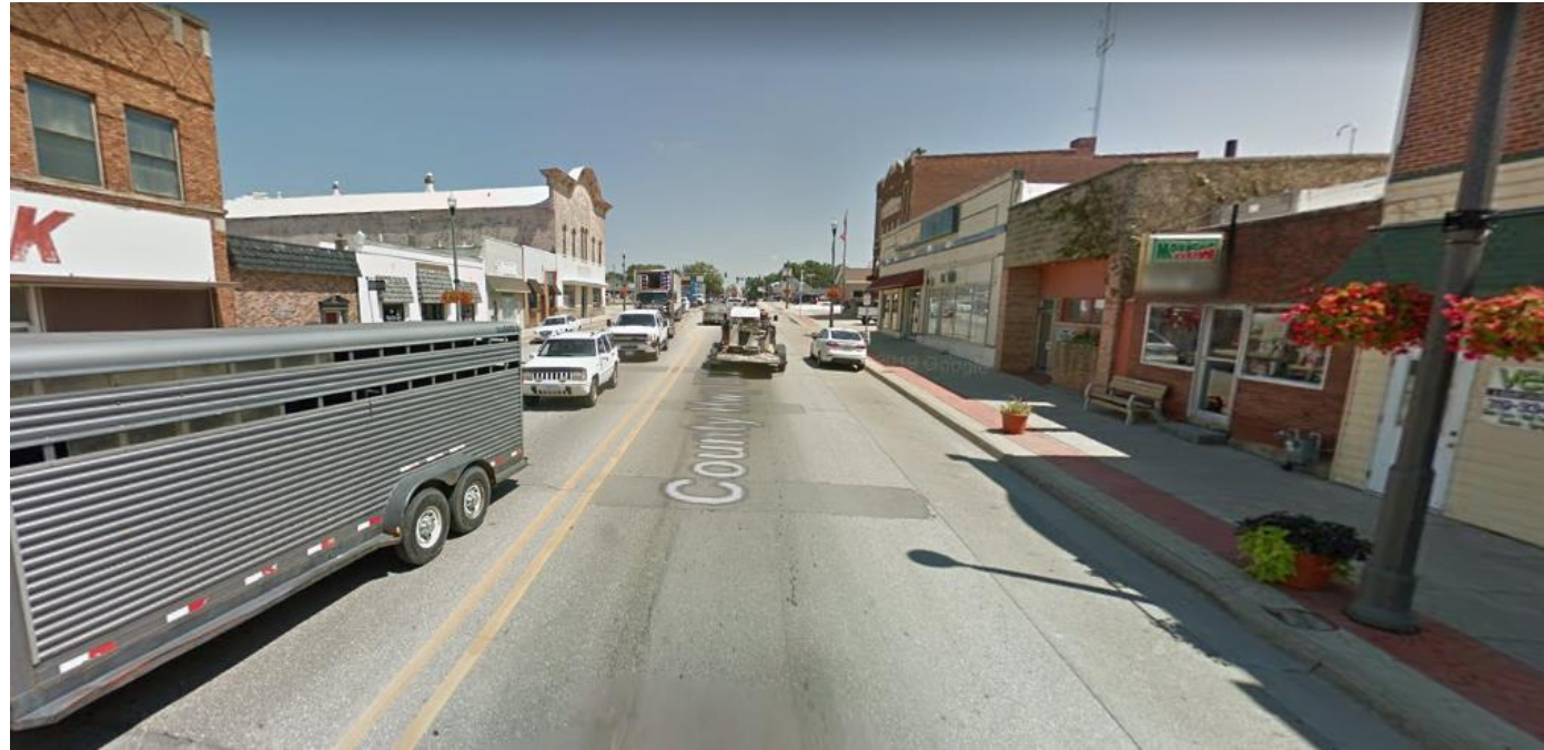
Independence looking east on Highway 150