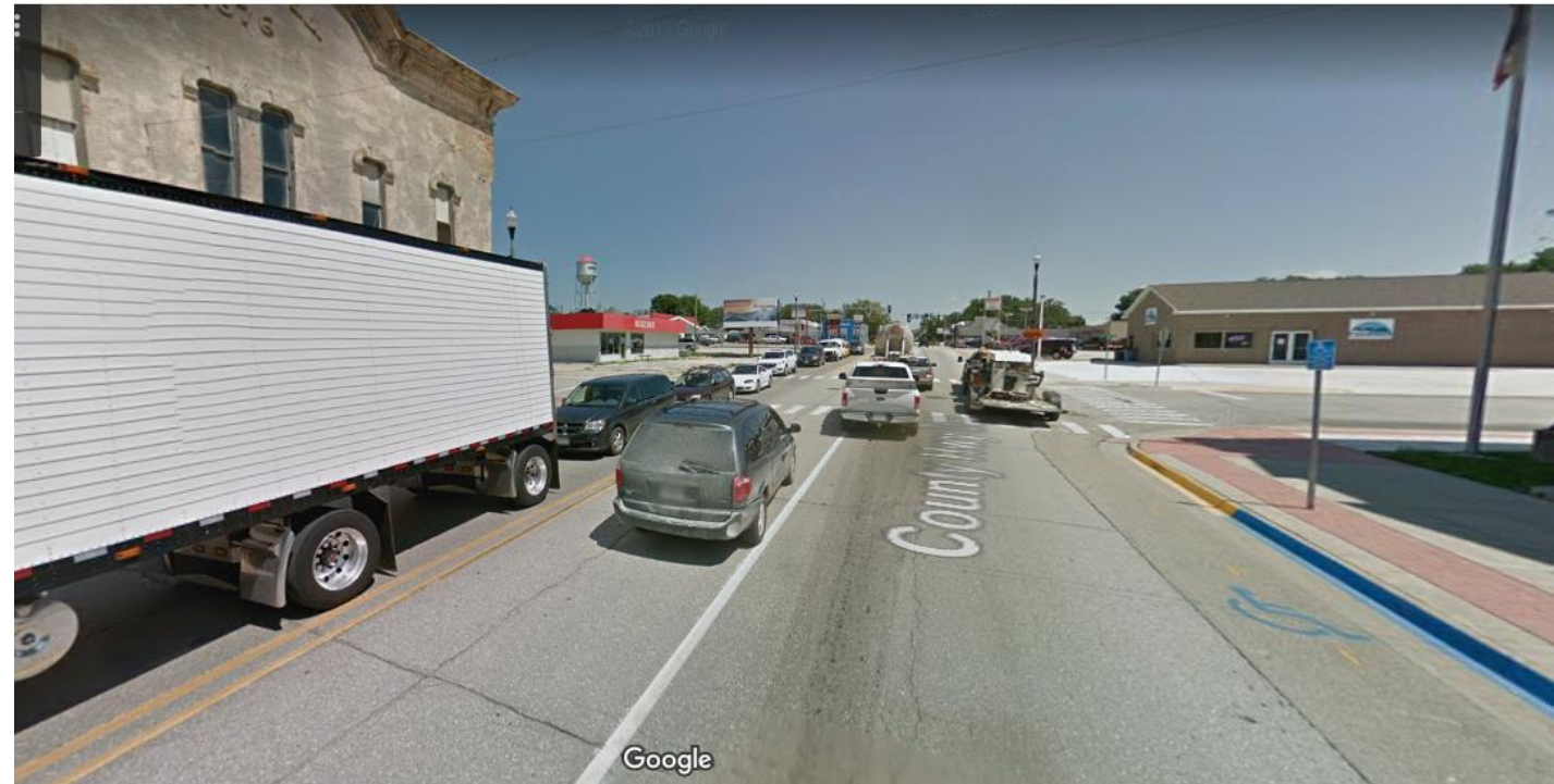
Independence looking east on Highway 150