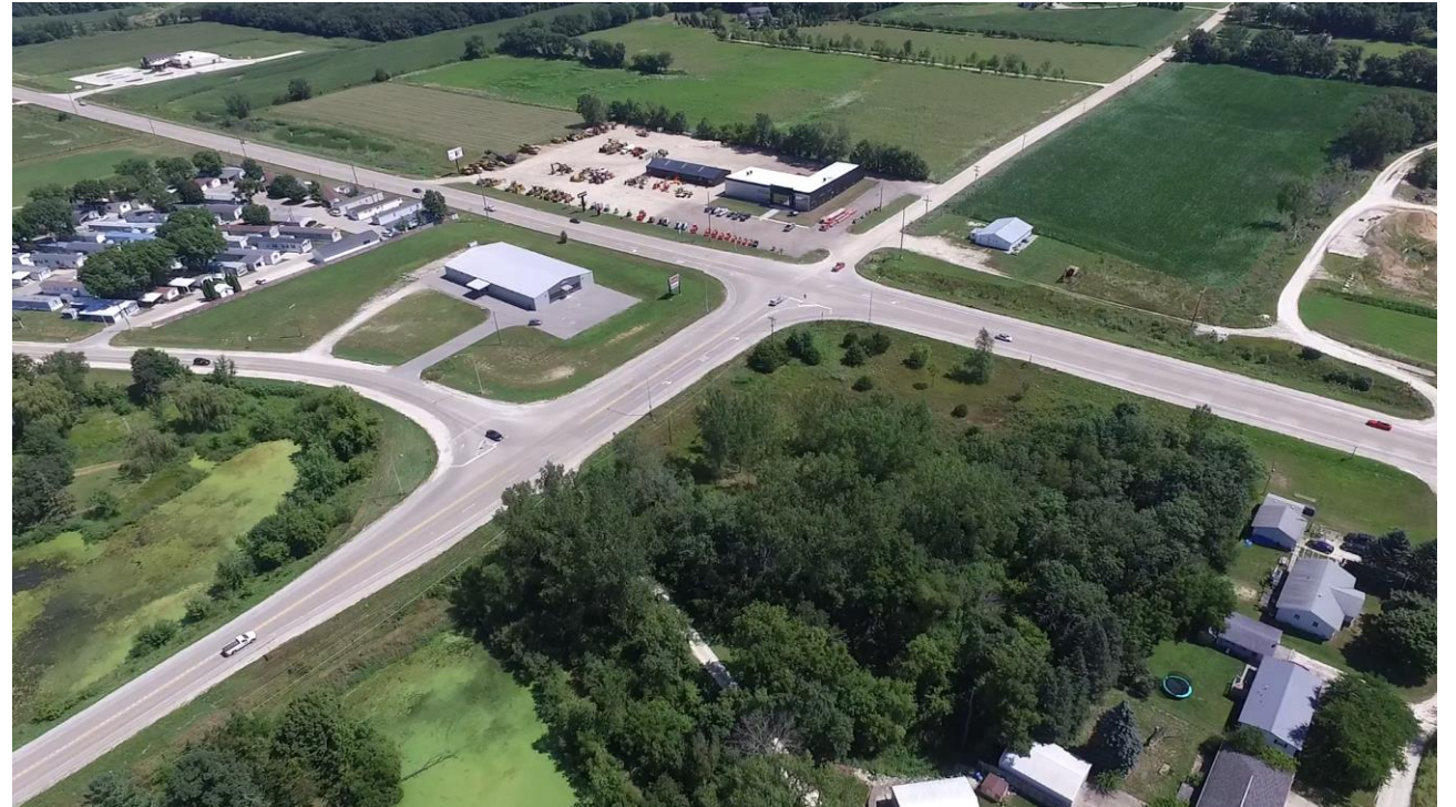
281 and 150 South of Oelwein