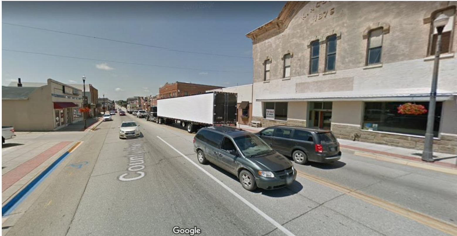
Independence downtown looking west on Highway 150