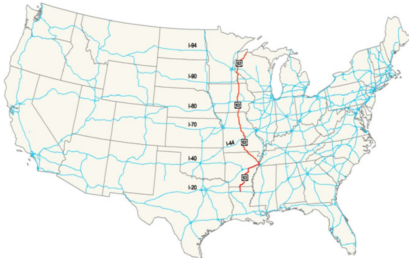
US 63 - ENTIRE ROUTE (1,286 MILES)