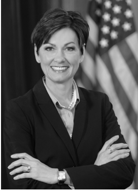
Kim Reynolds Governor of Iowa