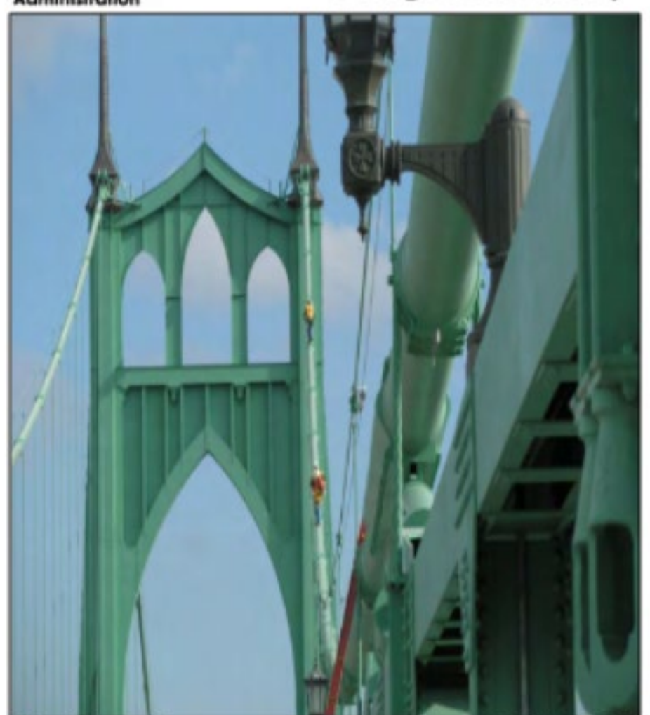
Office of Bridges and Structures