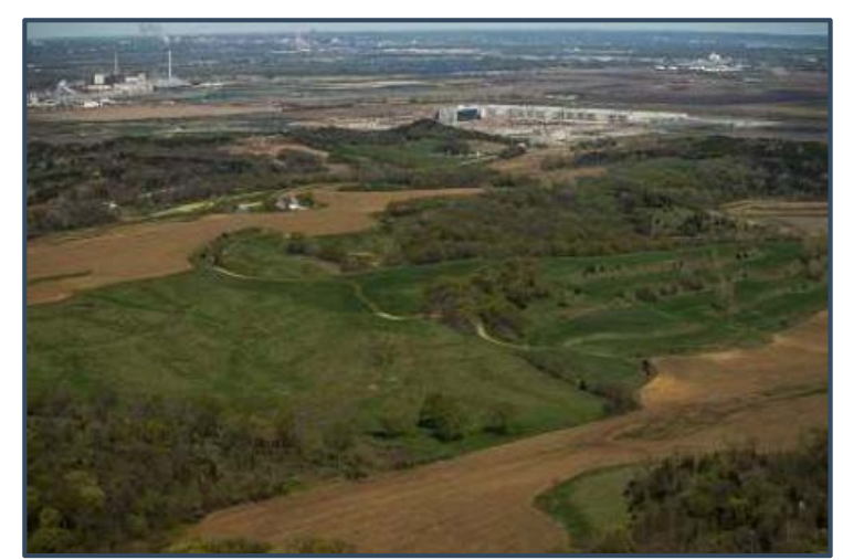
The Loess Hills National Scenic Byway (County Road L35) is bounded by Green Hill Ranch and Folsom Point Preserve.